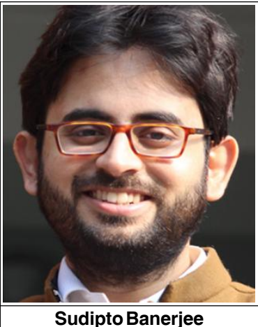
Research Fellow National Institute of Public Finance & Policy